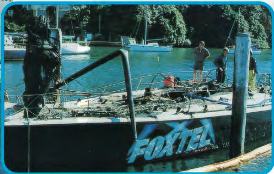
The charred and twisted hull of Foxtel Amazon lies in its berth at the Cruising Yacht Club of Australia.