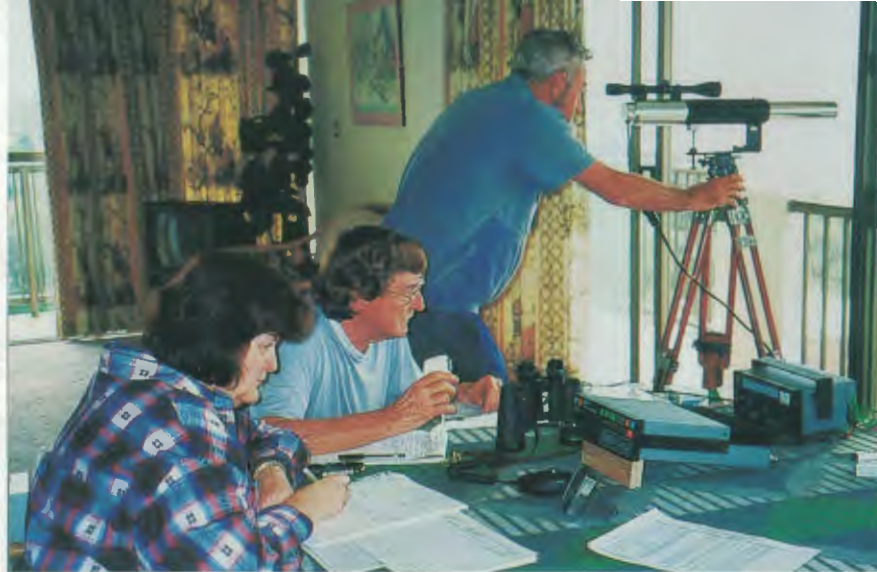
The finish team at Southport in action during the Canon Sydney-Gold Coast Classic. The same team have finished the race since its inception in 1986, using highly sophisticated laser beams and time-keeping to accurately check the yachts across the line.

Post to: OCEANTALK AUSTRALIA Unit 35, 9 Powells Road, Brookvale NSW 2100 Phone (02) 9905 7199 or 1800 029 948 Milne & Partners OT11065