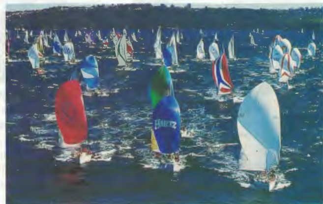
Top: Lake Macquarie yacht Stormrider ended up flying two spinnakers after it broached and hooked the sail of the Sydney sloop Hog's Breath Witchdoctor as the fleet cleared the Heads in the Canon Sydney-Gold Coast Classic. Above: Fresh to strong south-westerly winds gave the fleet in the Canon Sydney-Gold Coast Classic a fast spinnaker run down Sydney Harbour, but the breeze faded off the NSW North Coast over the weekend.